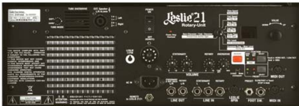
Leslie 2101 Rear Panel