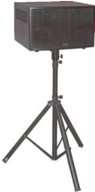
Rotary Unit #2101 mk2