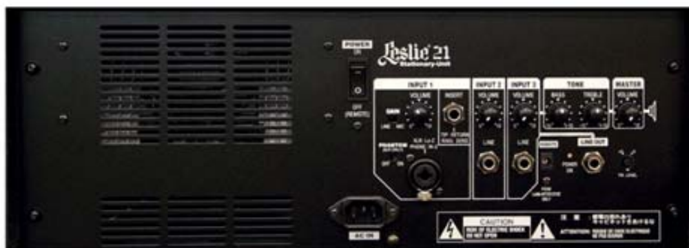
2121 Rear Panel