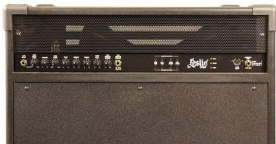
Leslie 3300 Rear Panel

This Leslie is housed in a rugged-built cabinet with a high-impact black finish. This will assure that your new Leslie will continue to look like new even after the most brutal road trips. The heavy-duty casters will make it a snap to transport to your next performance. The Leslie 3300 has been designed to interface directly with our Portable B-3 organ, Traditional and Pro XK Systems, and Hammond's popular XK-1 and XK-3 keyboards.